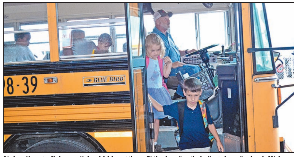
Union County Primary School kids getting off the bus for their first day of school. Welcome back, students!